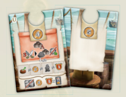
4 resistance tiles