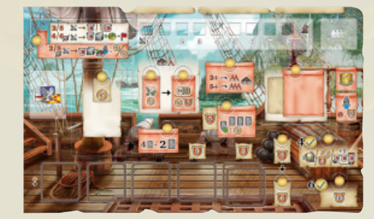
4 double layer ship boards

You can recognize this expansion's components by this symbol.